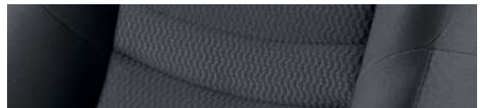
Cloth Seat Trim. Available on ST model only.