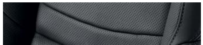
Leather accented ^ Seat Trim. Available on Ti & TL only.